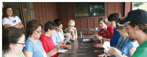
Youth and team activities

Phone 866.610.8877 toll free North America or 574.283.0279 • Fax 877-296-0856